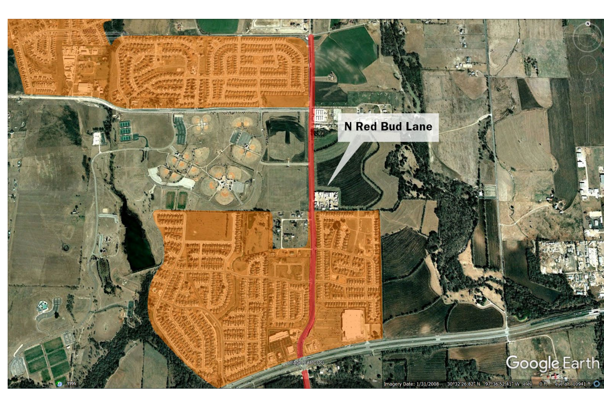
Project Area 2008