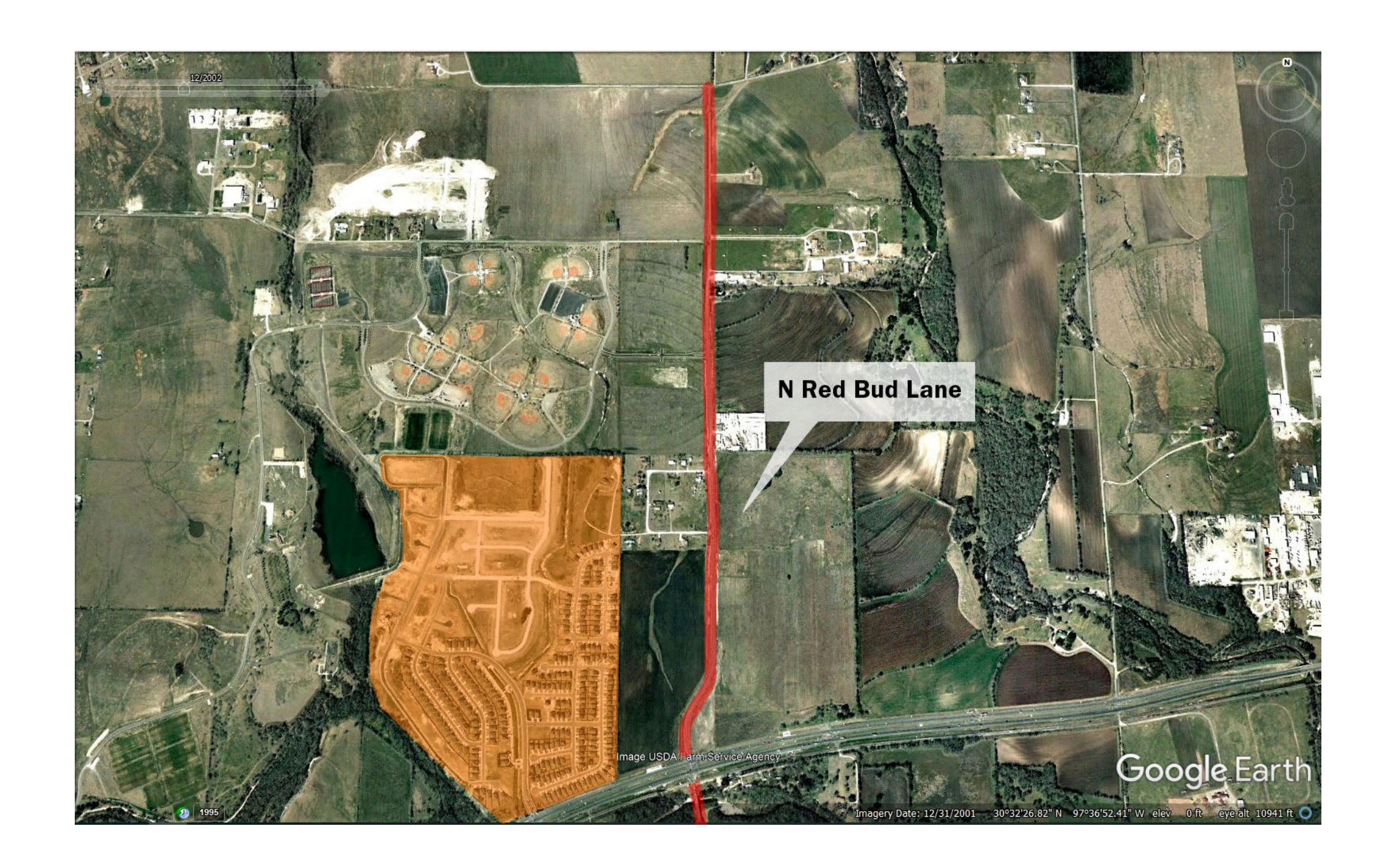
Project Area 2002