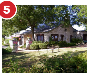
OLD STAGECOACH INN