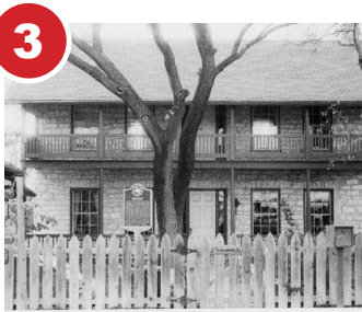
WILLIAM M. OWEN HOUSE COMPLEX