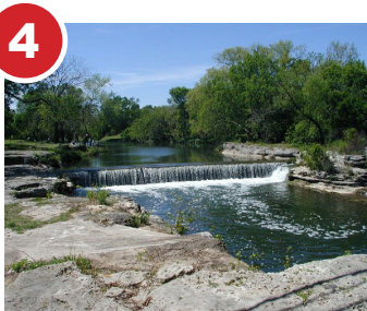
BRUSHY CREEK