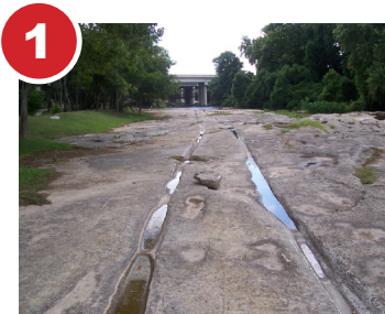
CHISHOLM TRAIL