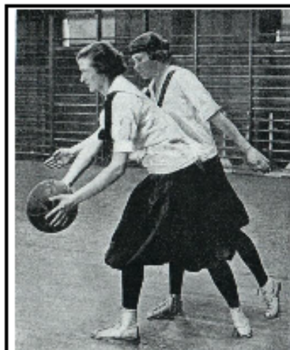
1920s-style uniforms and rules

Team uniforms resemble the original girls' basketball uniforms of the 1920s: