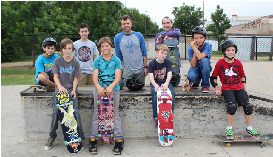
There is a need for additional recreational programming for all ages.

The City will develop other funding mechanisms to help supplement its limited funding resources. The Parkland Dedication and Park Development Ordinance will continue to fund land acquisition and park development. Fee structures will be assessed and cooperation with private citizens and developers will be encouraged in which development and Adopt-A-Park programs may become realized. Citizen participation will continue to be utilized in determining long-range planning to reflect the changing conditions in Round Rock.