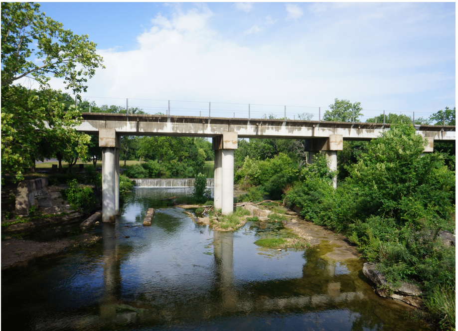
Preservation of environmentally sensitive corridors, such as floodplains, greenbelts, and areas with cultural significance is one of the ways PARD continues to be a good steward of the environment.