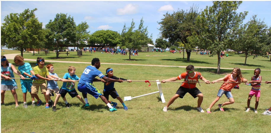
The Round Rock community highly values the events offered throughout the year.