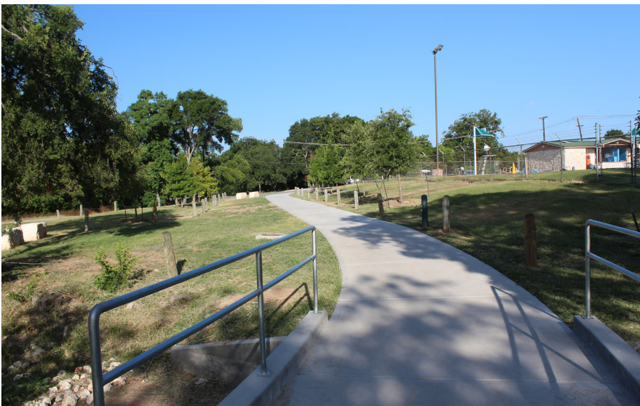
Residents have once again voiced a strong desire for an increased trail network.

There is also a lack of balance between recreational fields that can be used for league and every day use and the number of tournament quality fields which