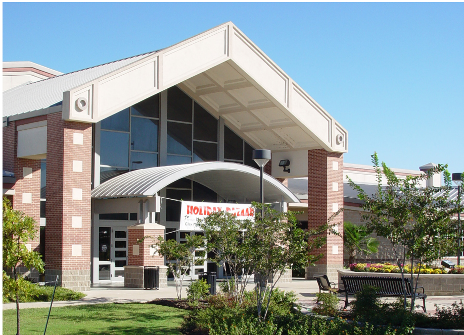
An additional recreation center is desired in the northern portion of the City to ensure that all residents have convenient access to a facility.