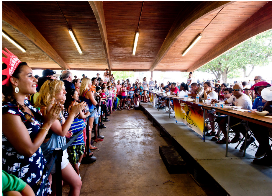
The City’s Repair and Replacement program is intended to help maintain the parks and recreation facilities throughout their lifespan of heavy use.

The PARD’s mission statement is to create positive and memorable experiences in people’s lives. In order to fulfill this mission statement, PARD should ensure equitable distribution of resources to all members of the community. Equity is one of the most important goals a parks and recreation department can have because it encompasses many facets of recreation. Parks and recreation equity includes, but is not limited to, providing easy access to recreational facilities and programs, offering varying types of facilities and programs, ensuring affordable access to programming, providing inclusiveness in facilities and programming, and designing facilities and programs intended for all demographics. Equity is about providing the same level of service to all residents of the community regardless of age, income level, ability level, or geographical location.