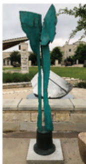
L Flora Bella VI Fabricated Bronze $20,000

Jason Quigno hcpai.com/ artists/jason-quigno 616-706-9222