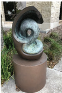
S Element - 1/1 $26,500