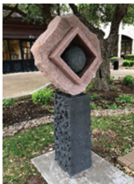
S Element - 1/1 $26,500

Candyce Garrett candycgarrett.com 575-937-1486