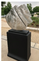
F Rocker IV Stainless Steel on Steel Base $35,000