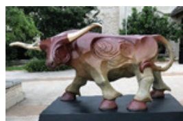
AA Longhorn "Big Bend" Bronze $53,000