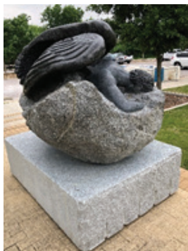
Y Awakening Granite $135,000