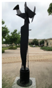
O Flora Bella VV Painted Steel $20,000