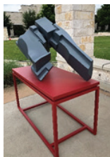
C Grey Stretch Painted Steel with base $25,000