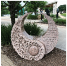
V Journey Granite with Bassalt Inlay $55,000