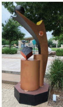
T Crossing Rock - 1/1 $18,000