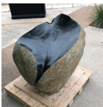
Q Zen Boulder 4 $6,500