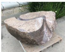
P River Stone $7,500

Jason Quigno hcpai.com/ artists/jason-quigno 616-706-9222