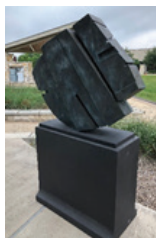
E Rocker III Bronze on Steel Base $50,000