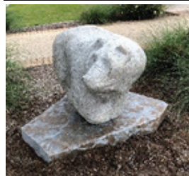
Z Pause NFS