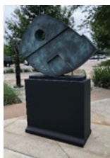
D Rocker II Bronze on Steel Base $50,000