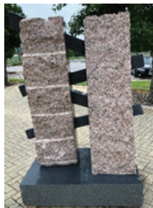
W Broken Ladder Basalt and Granite $45,000