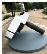
A Rocker I Stainless steel and Brass $50,000