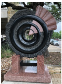
U Target Basalt and Granite $120,000