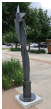
M Flora Bella VII Painted Aluminum $20,000