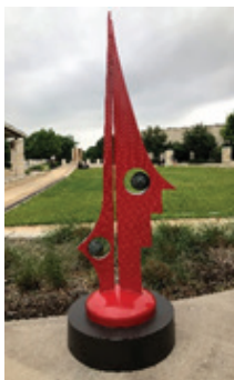
R Expression - 1/3 $24,500