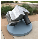
B Side Winder II Stainless steel and brass $20,000