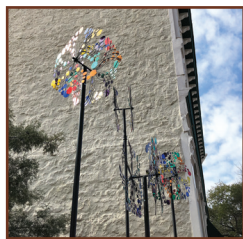
Bubble Wind Spinner NFS