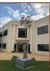
Kaleidoscope NFS