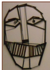
Iron Face by Isabella Puhala NFS