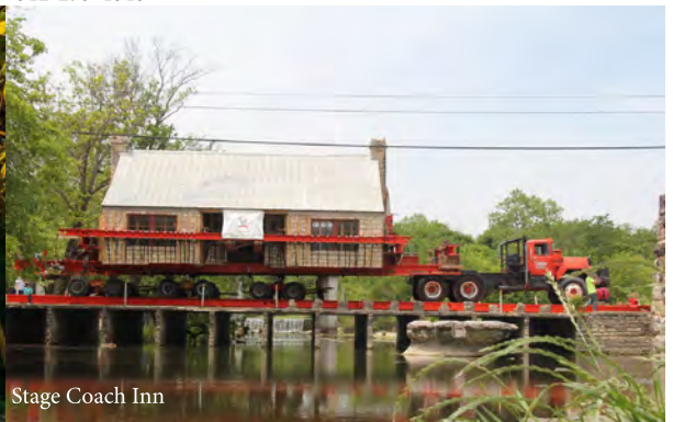
Stage Coach Inn

Half Day: 9:00 a.m. - 12:00 p.m. / 1:00 p.m. - 4:00 p.m., or Full Day: 9:00 a.m. - 4:00 p.m. (early drop off at 7:30 a.m. / late pick up at 6:00 p.m. available) Cordovan Art School, 3810 Gattis School Rd #108, Round Rock Cost: see website cordovanartschool.com 512-275-4040