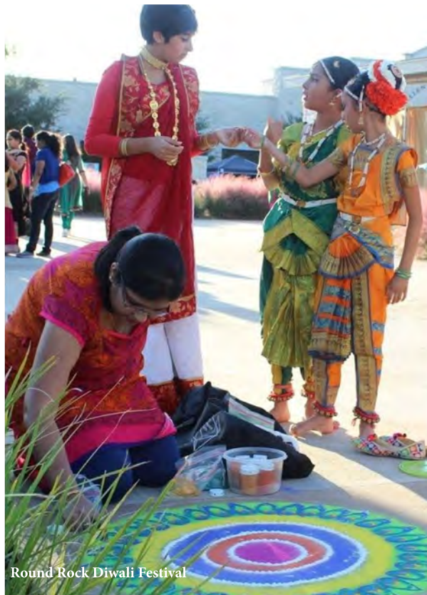
Round Rock Diwali Festival

10:00 a.m. - 1:00 p.m. Centennial Plaza, 301 West Bagdad, Round Rock FREE roundrocktexas.gov 512-844-9542