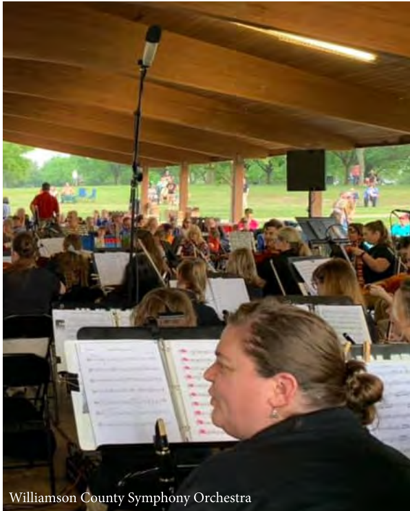
Williamson County Symphony Orchestra