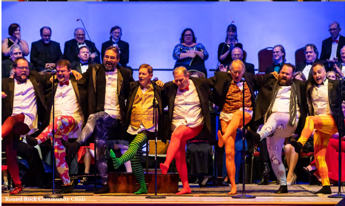
Round Rock Community Choir