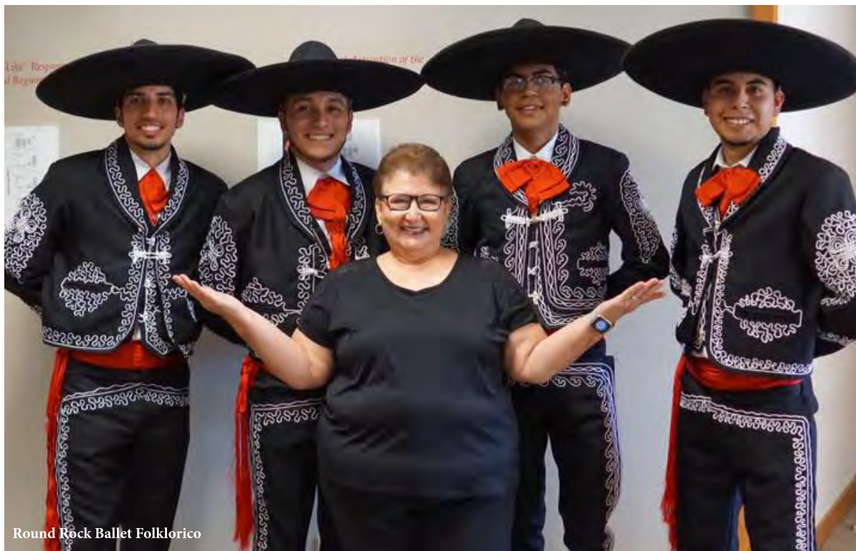
Round Rock Ballet Folklorico