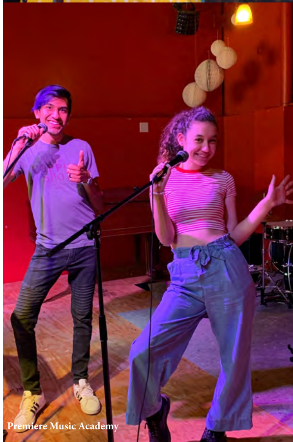
Premiere Music Academy