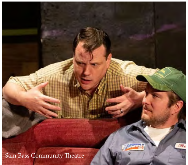
Sam Bass Community Theatre