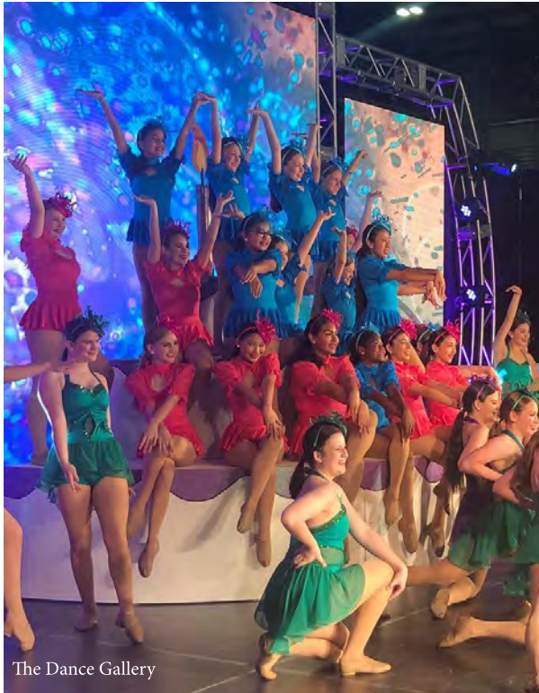
The Dance Gallery