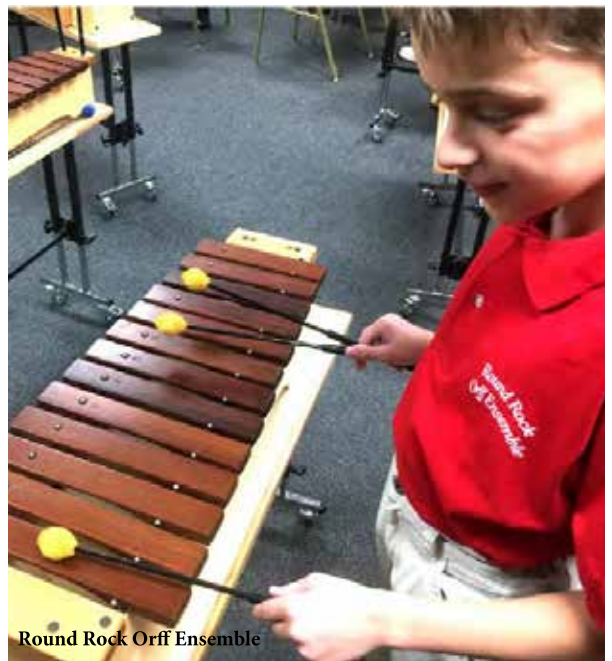
Round Rock Orff Ensemble

2:00 p.m. Round Rock Presbyterian Church 4010 Sam Bass Road, Round Rock tobyornotobe@aol.com