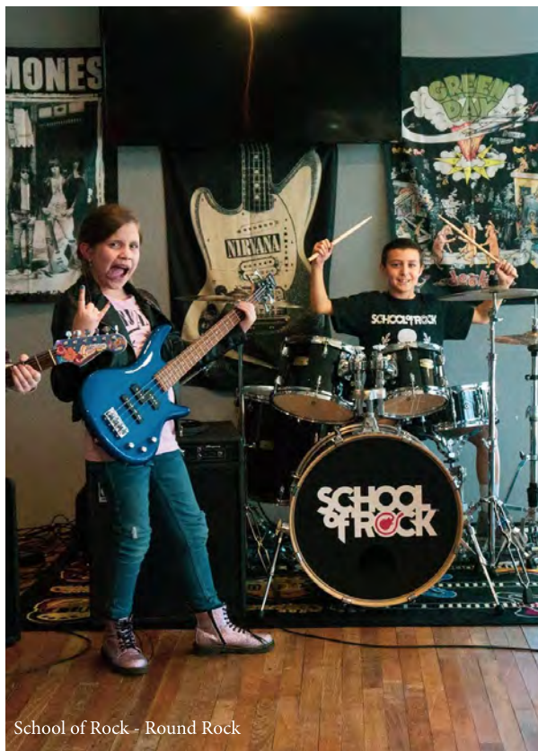
School of Rock - Round Rock