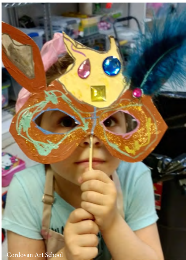
Cordovan Art School

Sam Bass Community Theatre 7:30 p.m. 600 North Lee Street, Round Rock $12 - $15 sambasstheatre.org 512-763-7228