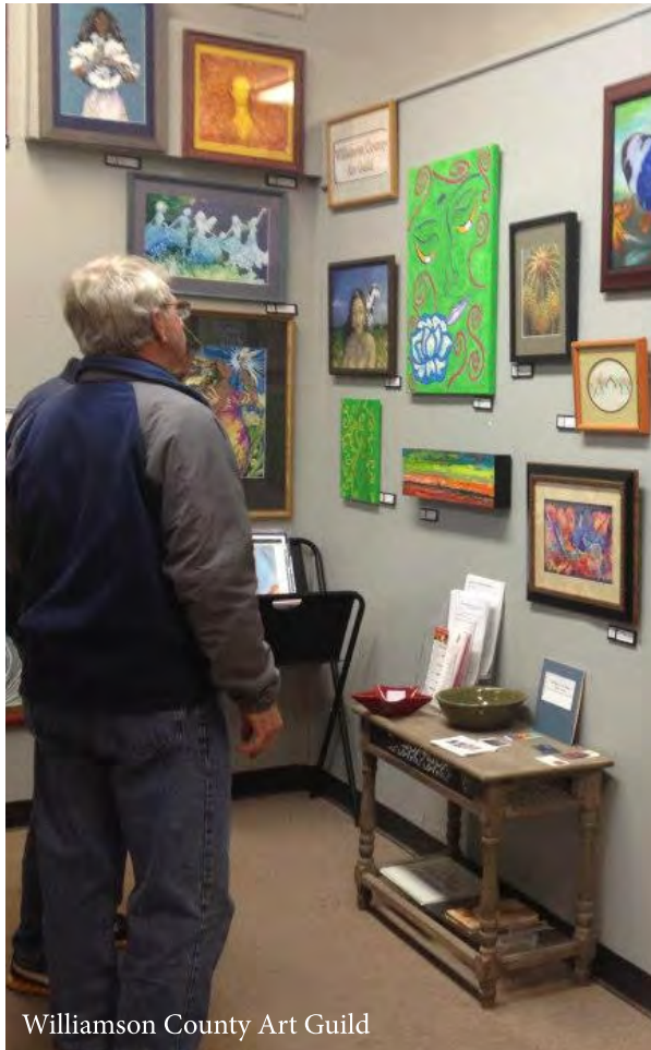
Williamson County Art Guild