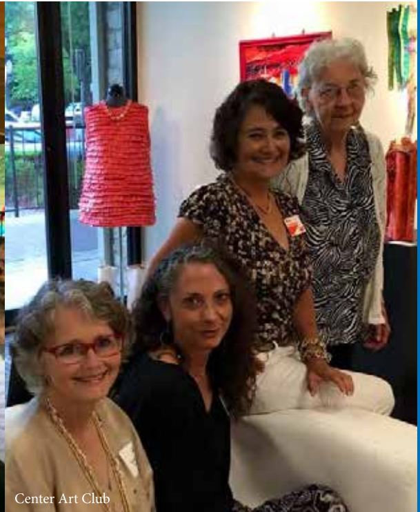
Center Art Club