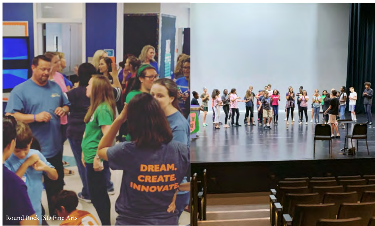
Round Rock ISD Fine Arts