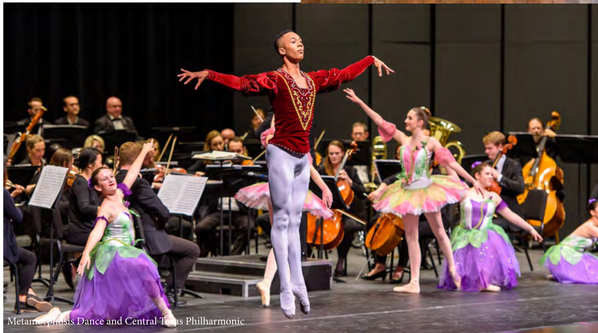
Metamorphosis Dance and Central Texas Philharmonic