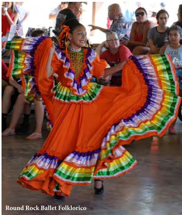
Round Rock Ballet Folklórico