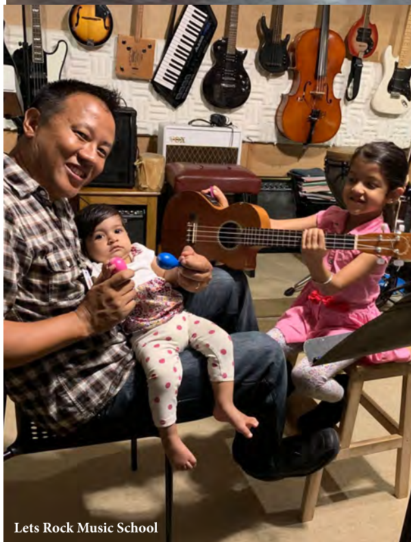
Lets Rock Music School