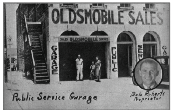
Broom Factory converted to auto sales