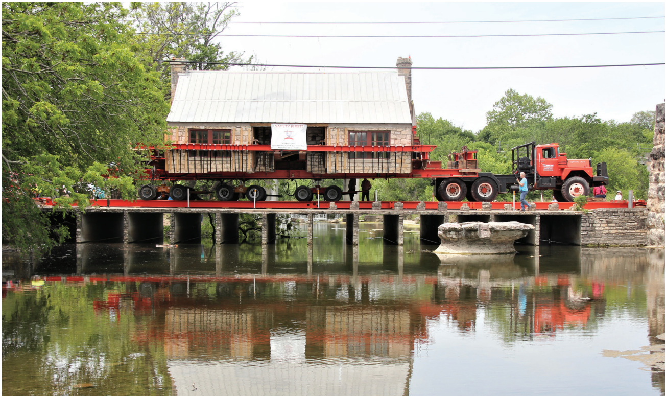
The Stagecoach Inn crossing Brushy Creek before reaching new location at Bathing Beach Park

In 2017, the city provided a one-time allocation from Hotel Occupancy Tax (HOT) funds for the relocation of the Stagecoach Inn. The building was set to be demolished for the realignment of RM 620. Instead, the structure was moved in 2018 from its original location at the intersection of RM 620 and Chisholm Trail Road to its new location at the Bathing Beach Park, located approximately 1000 feet to the south.