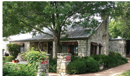
Stagecoach Inn, built 1848-1853