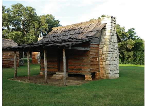
Cabin in Old Settlers Park