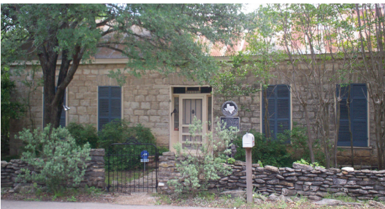
Barker-Porter house, built 1872