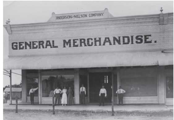
200 E. Main built 1904