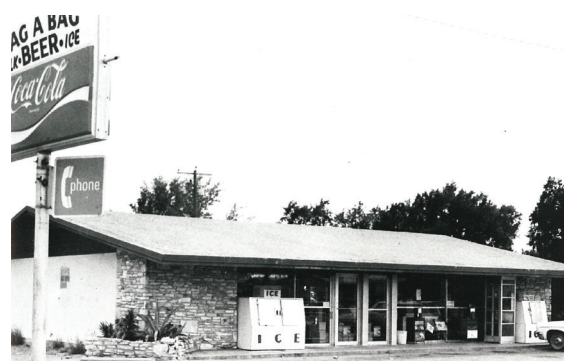
Wag-A-Bag on US Highway 79 built 1971