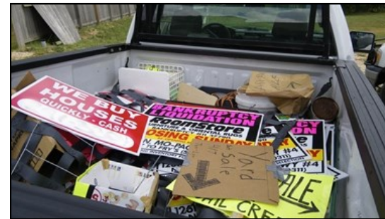
The Code Enforcement Division removes and disposes of 6,000-10,000 bandit signs each year.

The new ordinance includes maintenance standards for signs. Signs, including banners and temporary signs, must be removed if they become tattered, torn, damaged, or non-operational.