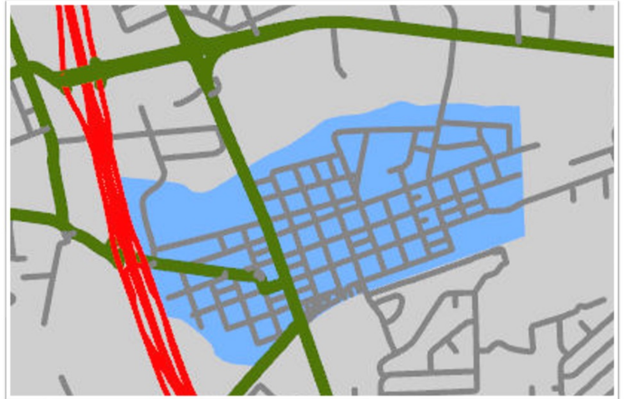
Downtown Development Area as defined in the Code of Ordinances