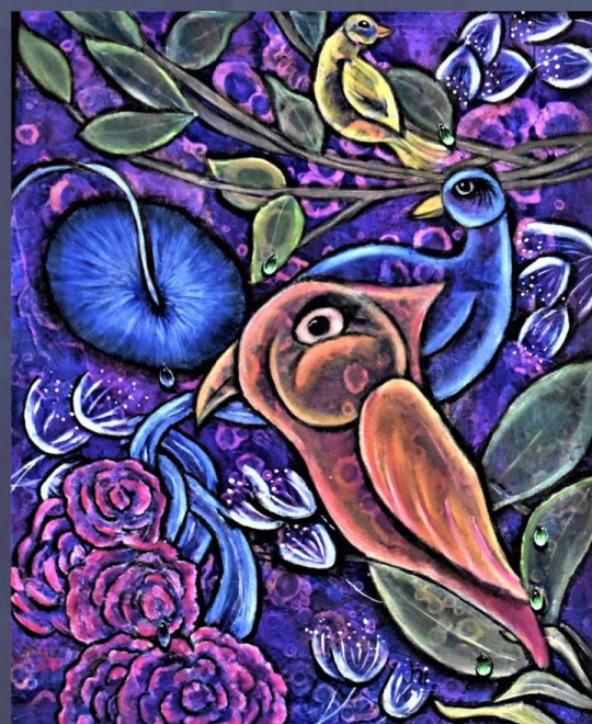
Artwork by Jeanice Ullman

TABLE TENNIS FOR BEGINNERS NEW ON THURSDAYS 4:30 - 8:30 PM