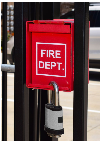
Fire Dept. Access box with Knox® Padlock on front