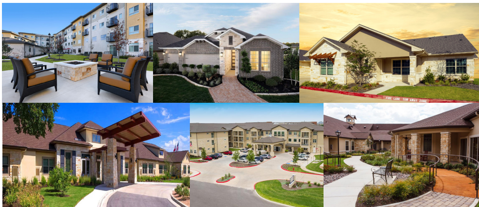
Images, clockwise, from upper left: Affinity at Round Rock, Heritage at Vizcaya, Emerald Cottages at Round Rock, Bel Air at Teravista, The Enclave at Round Rock, Poet's Walk

While not all older adults desire to live in senior housing, Round Rock aims to provide senior housing for all those who seek it. On average, 12% of Americans 50 and older wish to age somewhere other than their current home (Robinson-Lane, 2022). Assuming similar demand exists for the residents of Greater Round Rock 55 and older, Greater Round Rock may not meet current demand for age-restricted living. On average, 2% of Americans 65 and older live in assisted living. If similar demand exists in Greater Round Rock, Greater Round Rock provides an adequate amount of assisted living. Greater Round Rock's nursing facility capacity is less than the average American demand for this type of senior care, where 4.5% of Americans 65 and older reside in a nursing home. This may indicate that demand for nursing homes is not as high in the Greater Round Rock area or that nursing home capacity does not meet current demand. Round Rock may wish to do further research to determine its need for additional senior housing of all types. Additionally, the needs of older adults extend beyond housing. To ensure that Greater Round Rock remains a place where people want to retire, the city should continue to support services such as healthcare, transportation, and programming.