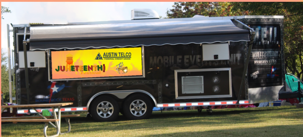
Mobile Events Unit