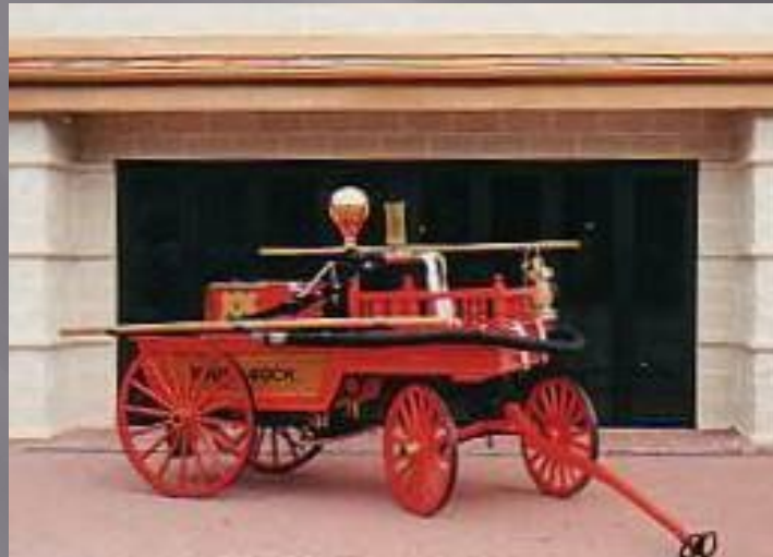
Picture taken in front of the Main Street Library